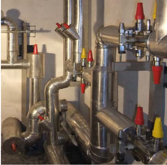
Fig 2: The use of ICF Flexline™ valve stations on the distribution lines of evaporators in storage rooms

Due to the lack of space and the limited time available for installation work, the combined ICF Flexline™ valve station was applied on the distribution lines of the storage chambers. The ICF Flexline™ valve stations were installed on the liquid ammonia lines for the evaporators (fig. 1 and 2) and the hot ammonia gas lines used for defrosting the evaporators (fig. 1 and 4).