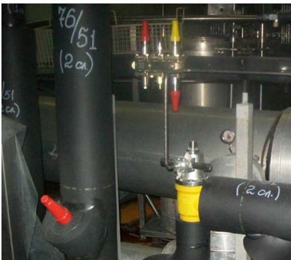
Fig 3: ICF valve stations fitted on evaporator defrosting lines

Due to the lack of space and the limited time available for installation work, the combined ICF Flexline™ valve station was applied on the distribution lines of the storage chambers. The ICF Flexline™ valve stations were installed on the liquid ammonia lines for the evaporators (fig. 1 and 2) and the hot ammonia gas lines used for defrosting the evaporators (fig. 1 and 4).